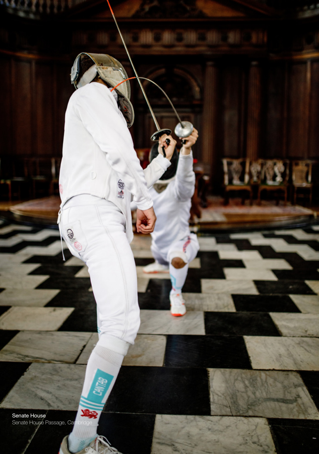
Senate House Senate House Passage, Cambridge