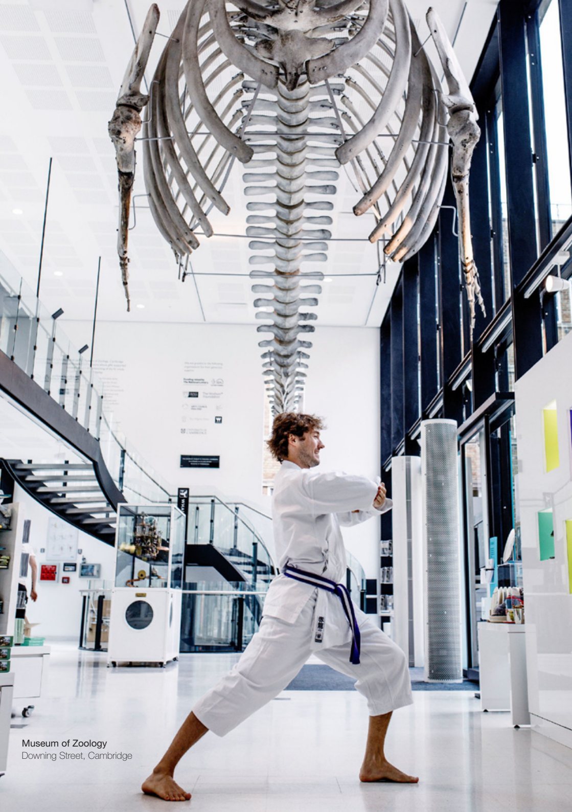
Museum of Zoology Downing Street, Cambridge