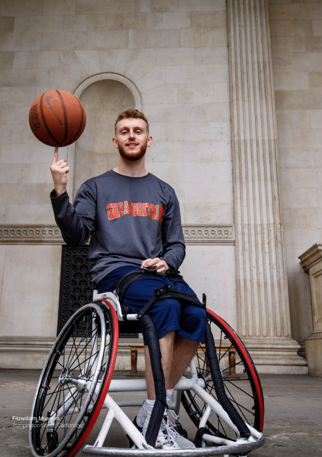
Fitzwilliam Museum Trumpington Street, Cambridge