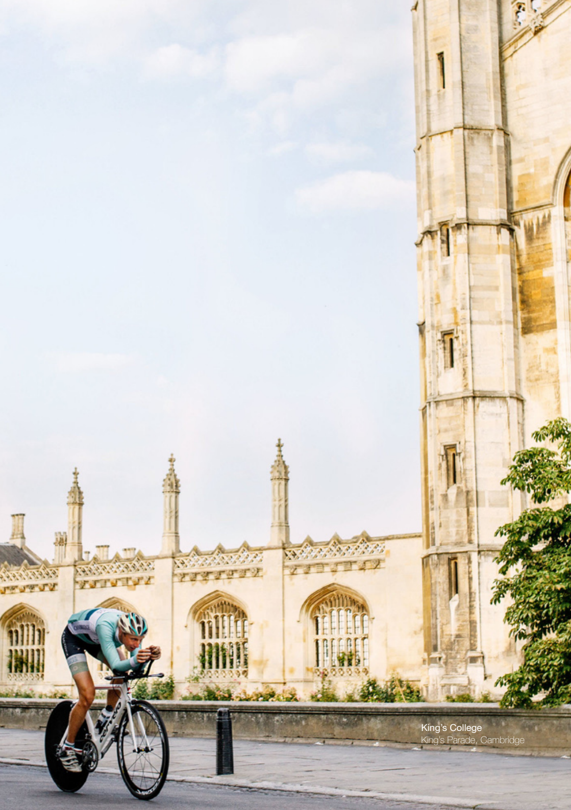
King's College King's Parade, Cambridge