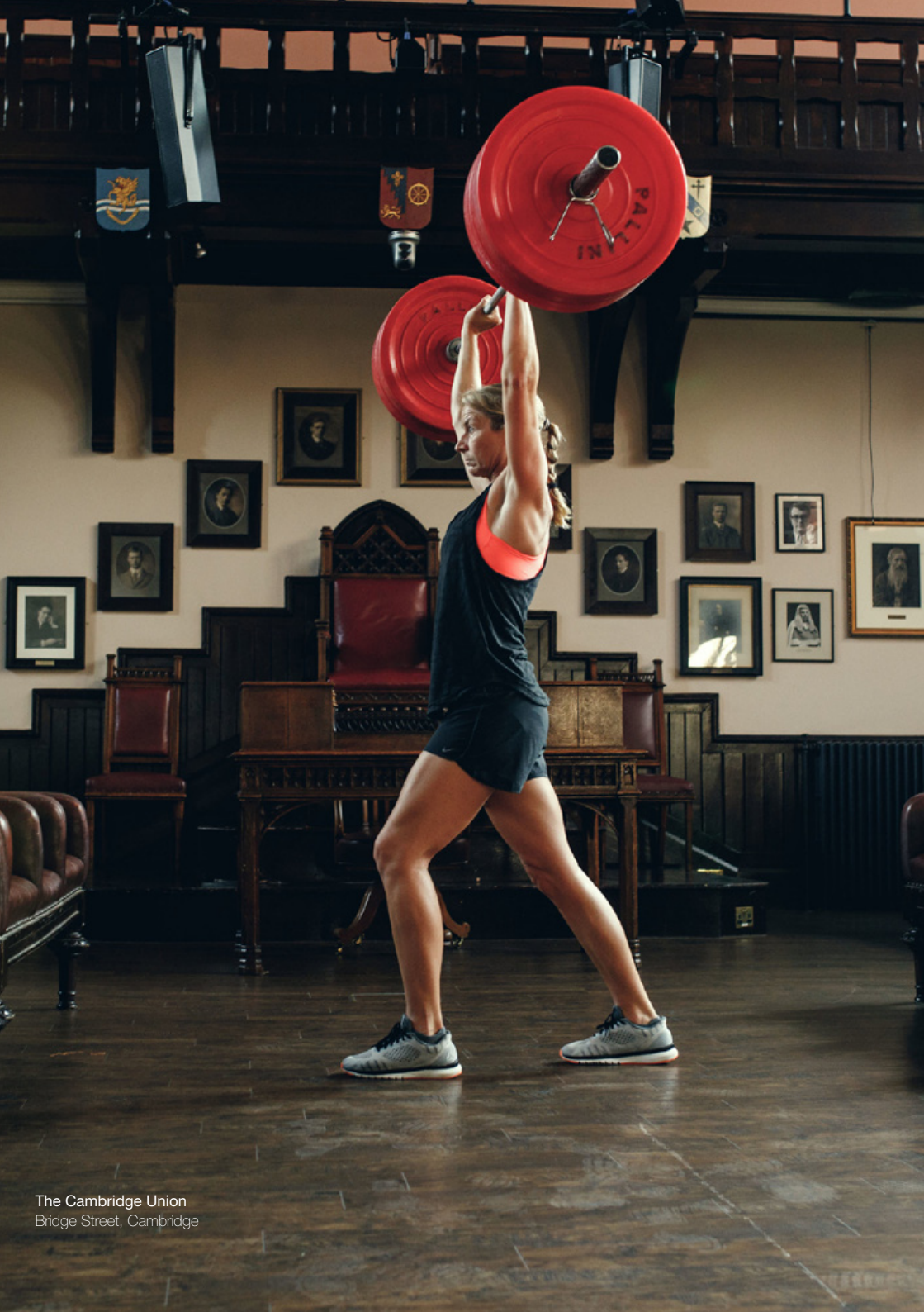
The Cambridge Union Bridge Street, Cambridge